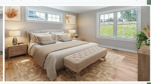
55% More Efficient*

On average, our homes are 55% more energy-efficient than homes built to standard code.