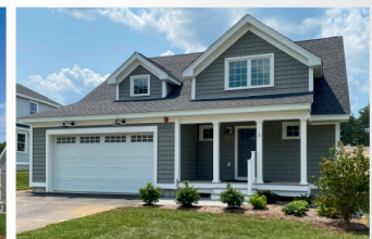
UNIT 26 "ORKNEY" MOVE-IN READY 2 Bed | 2.5 Bath 1,997 SqFt $760,900