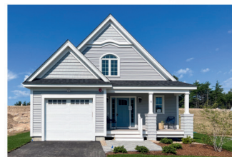
UNIT 27 "MOIRA" MOVE-IN READY 2 Bed | 2.5 Bath 1,875 SqFt $747,900

Purchase a completed home, or reserve a homesite now to be in by next Winter.