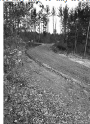
Temp Access Road Connecting AVS & Safety Complex