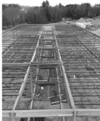
Aerial View of New Classroom Wing

The Building Committee comprised of AVS and SAU 15 leadership, town officials, construction management and architecture companies, and School Board members continues to meet each week to discuss the progress of the project, review designs and vendor bids, and address any day-to-day needs of the school.